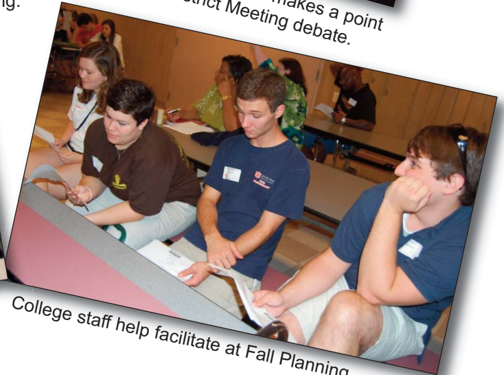
College staff help facilitate at Fall Planning.